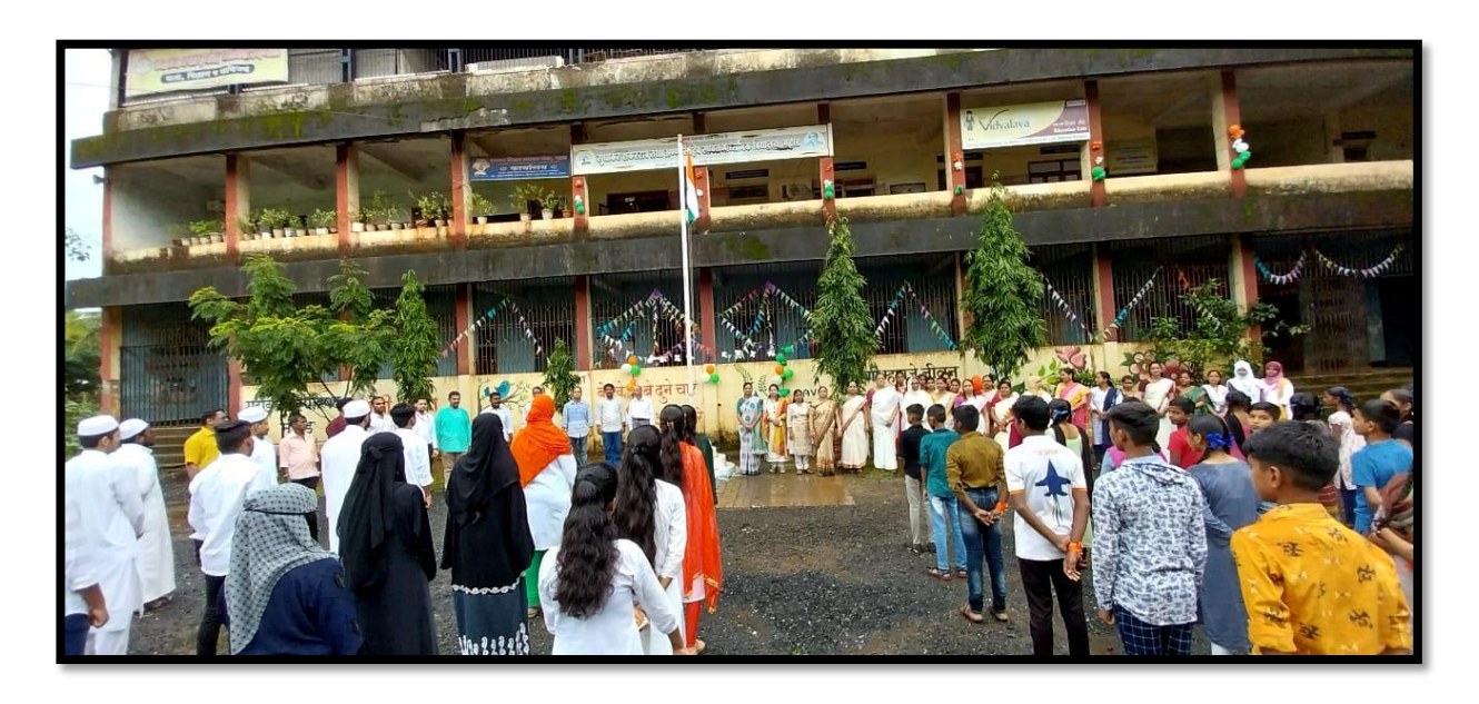
Republic Day Celebration on 26<sup>th</sup> January

Celebration of Independence Day August 15<sup>th</sup>