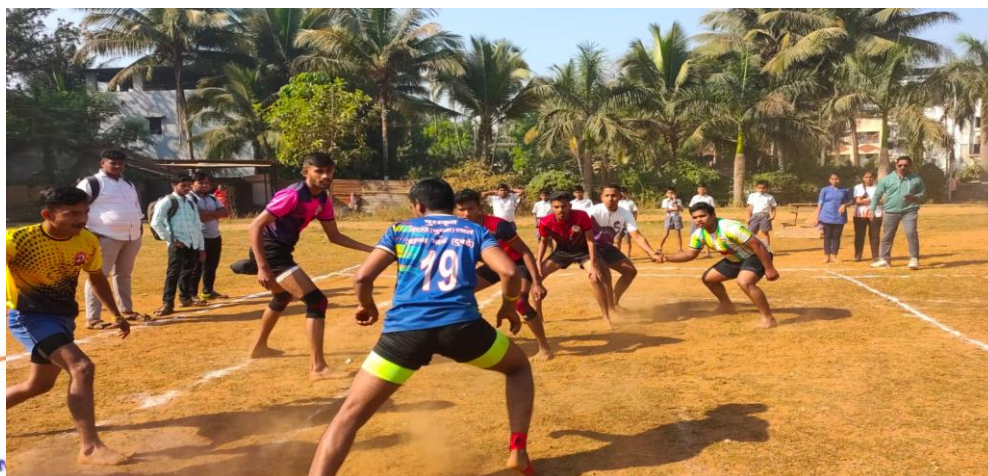
Commerce At post Mahad- Raigad.